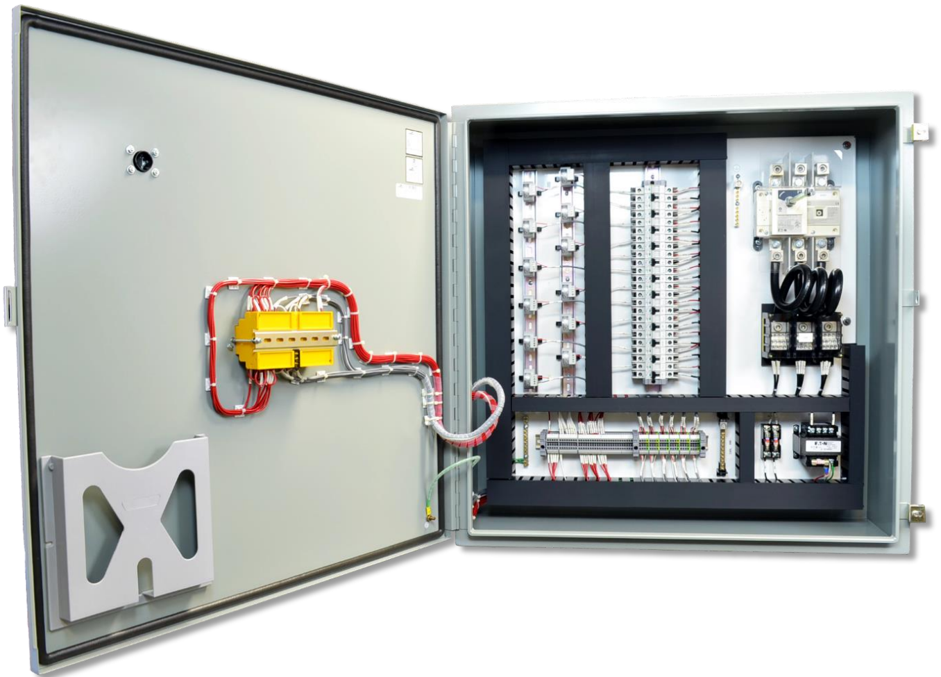
Figure 2 - Interior view of ProCS™ with microprocessor