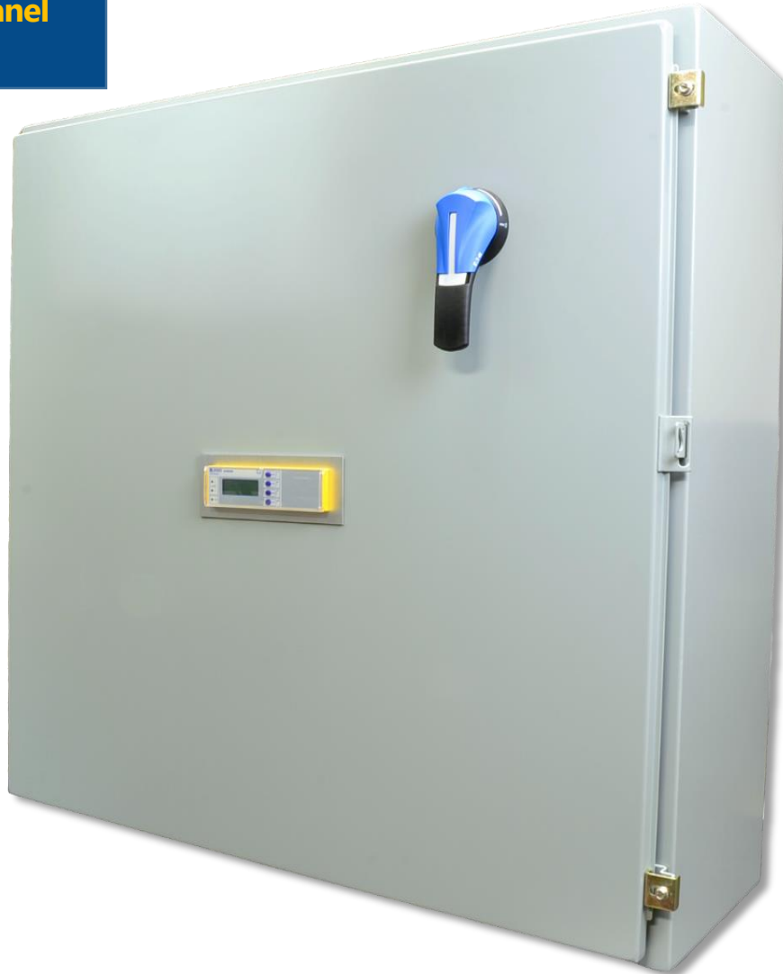
Figure 1 - Exterior view of ProCS™ with microprocessor