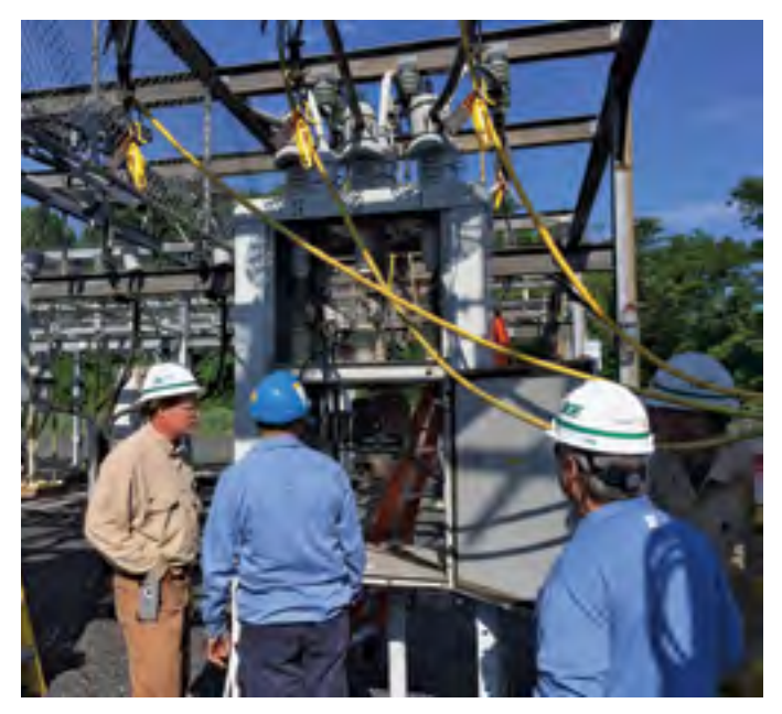
CBS Northeast tested a 15-kV, 1200-A vintage Westinghouse vacuum breaker that the utility thought might have a questionable vacuum interrupter.

All three VIs showed 10-4 numbers and the questionable phase ("C") that the operations group attributed to a system issue and not a VI problem, but the MAC-TS4 verified this. All parties seemed impressed, and the engineering manager from the utility requested that the company proceed with purchasing a set from CBS Northeast.