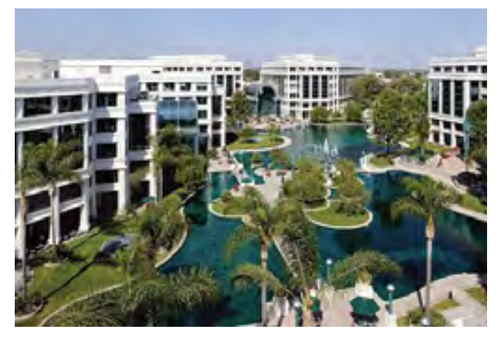
Beautiful on the outside, but danger within: Failing ground fault relay system and interlocks lurked at the Water Garden office campus in Santa Monica, CA.